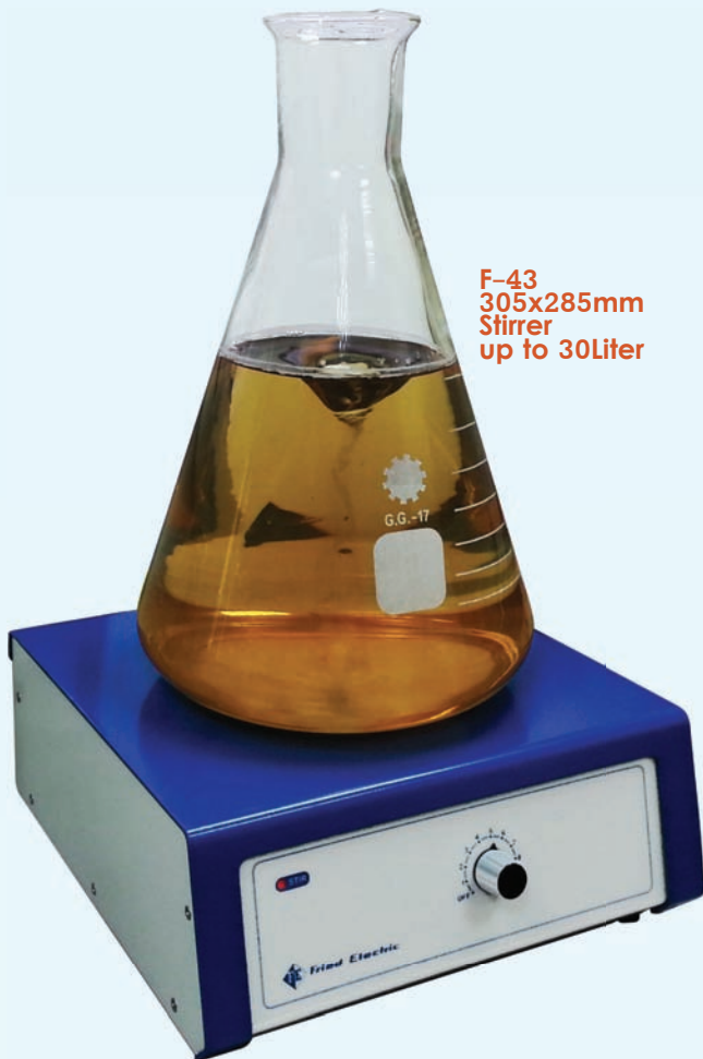
F-43 305x285mm Stirrer up to 30Liter