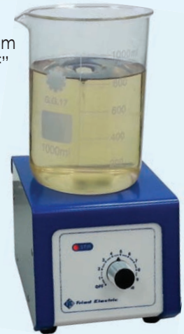
F-23 130x145mm Stirrer up to 8Liter

Powerful drive magnet • Strong motor-stirs up to 8 Liter water • Compact design maximizes use of available bench space • Variable speed control up to 1200rpm • Electronic speed control with "OFF" position • Available as 4-position stirrer, & 6-position stirrer • Powerful motor & strong magnet provide exceptional stirring even with a solution that has a viscosity similar to cooking oil • Durable, easy-to-clean, corrosion-resistant top plate available.